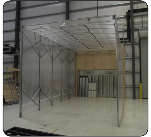
Highly translucent fabric lets light shine in.