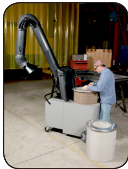
Portable Fume Filtration