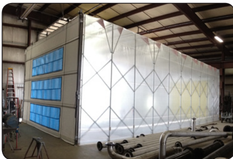
Retractable Paint Booths & Filtration Systems EPA 6H Compliant

ASK ABOUT OUR RETRACTABLE PAINT BOOTHS & HYBRID DUST/PAINT BOOTHS