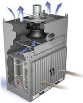
Power Module Filters Dust & Turns Enclosure Into A Wind Tunnel

WE CAN PROVIDE YOU WITH DUST & FUME FILTRATION SOLUTIONS AS WELL: