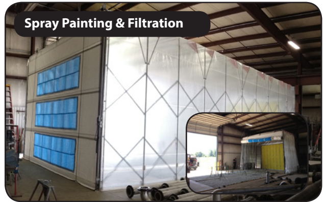
Spray Painting & Filtration