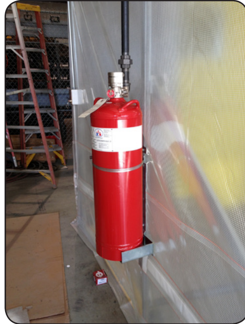
Fire Suppression Systems