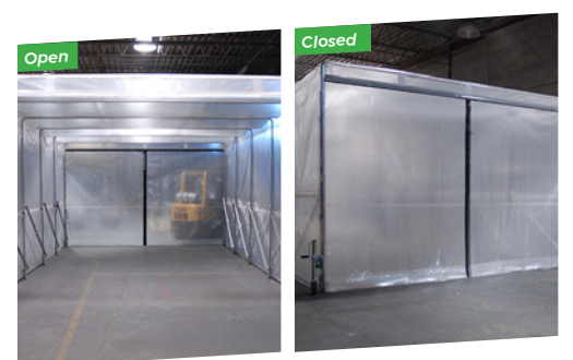
End Option: Curtain Door