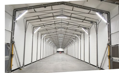
LED Lighting - IP6X Dust-Proof or Explosion-Proof