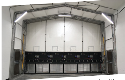
End Option: Rear Fabric Wall with Filtration Port