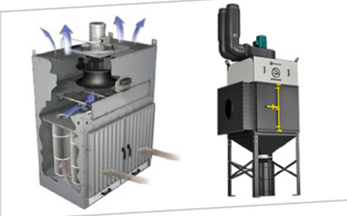
Dry Dust/Fume Collectors for Non-Explosive Dusts/Fumes