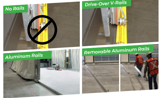
Many Rail Configurations

Supervision & Turn-key Installation Services Available