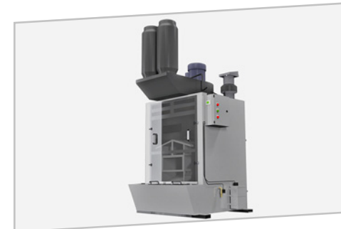
Wet Dust Filtration Systems for Explosive Dusts