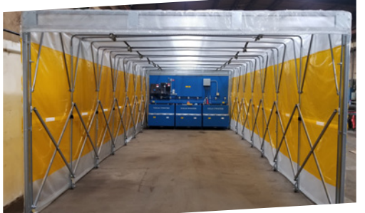
End Option: Open