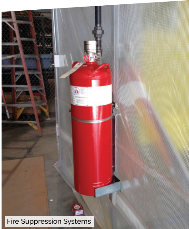
Fire Suppression Systems