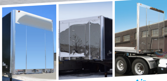
Stainless Steel Skin, Custom Air Deflectors, Man Doors, Extra LEDs