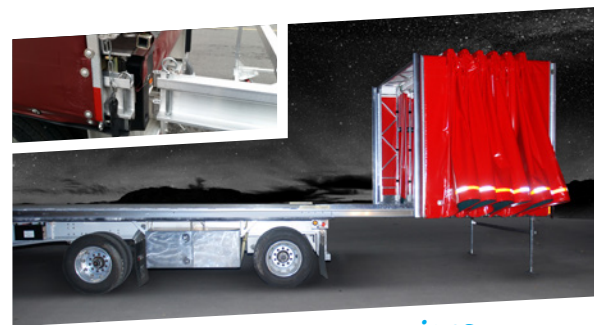
Portable Rail Extensions