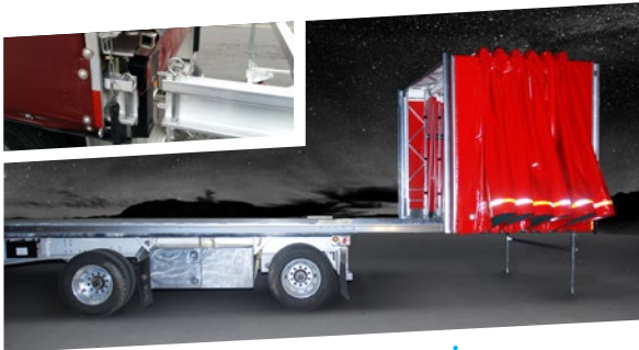
Portable Rail Extensions