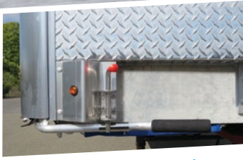
Quickest Tensioning System