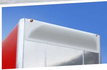
Air Deflector & LEDs