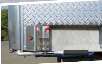
Quickest Tensioning System