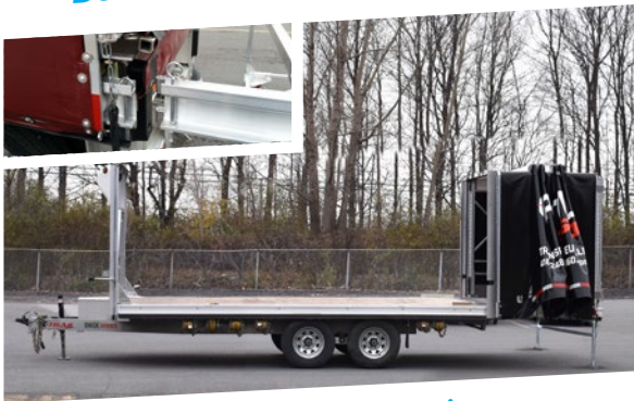
Portable Rail Extensions