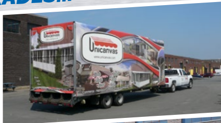
Digital Printed Graphics